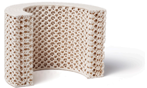
Figure 2: EXACTPORE™ cross-section of a tubular filter.

Together, tubular EXACTPORE™ 3D filters with EXACTFILL™ filter housings provide a powerful combination for metal filtration. The high-performance system shows its strength in terms of process costs: Due to the enormous filtration capacity, robustness of the material, pore structure as well as the self-supporting geometry of the tubular EXACTPORE™ filters, the solution offers particularly great advantages for the very cost-intensive areas of casting rework and machining. Foundries can therefore achieve considerable savings in terms of energy consumption, tool wear and working time.