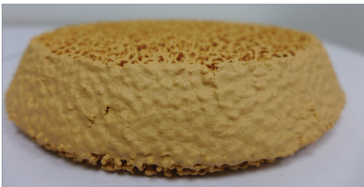
Fig.5 Conical filters are also available with all-round edge protection