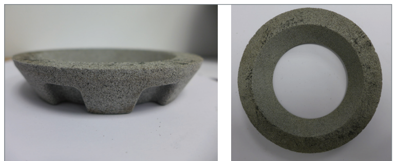
Fig.3 Buoyancy aids for filters (support rings)