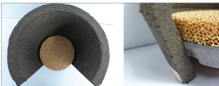
Fig.4 Filter on support ring in the riser with possible bypass formation