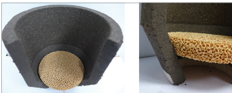
Fig.6 Precisely fitting seat of the conical filters