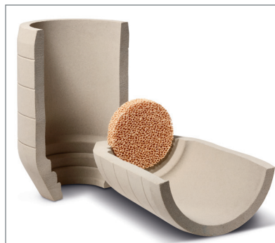
Fig.1 Sprue-riser with filter (example)

To remedy the problem, suppliers offer buoyancy aids in the form of rings specially designed for neck-down risers (support rings, fig.3). These aids are