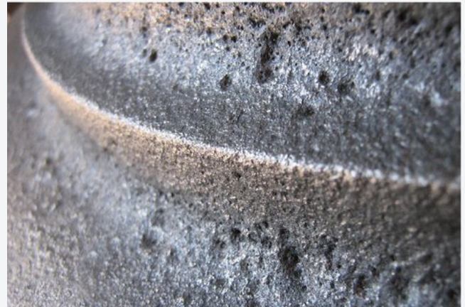
Figure 1: Elimination of surface defects: Fluorine-free risers from ASK Chemicals enhance productivity by eliminating surface defects caused by fluorine reactions.