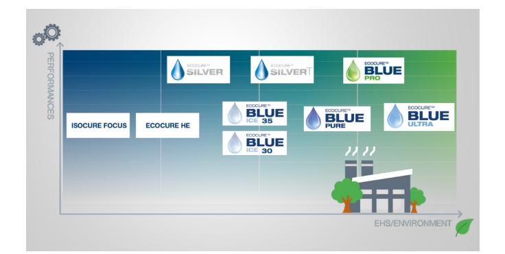
Figure 2: Comparison of binder systems in regards to performance and EHS/Environment.

The new ECOCURE<sup>™</sup> BLUE PRO technology offers foundries the opportunity to significantly improve the emissions and environmental performance of their processes. Thanks to its high efficiency, the binder content can be reduced by 0.05% for the same strength as ECOCURE<sup>™</sup> BLUE (Figure 1).