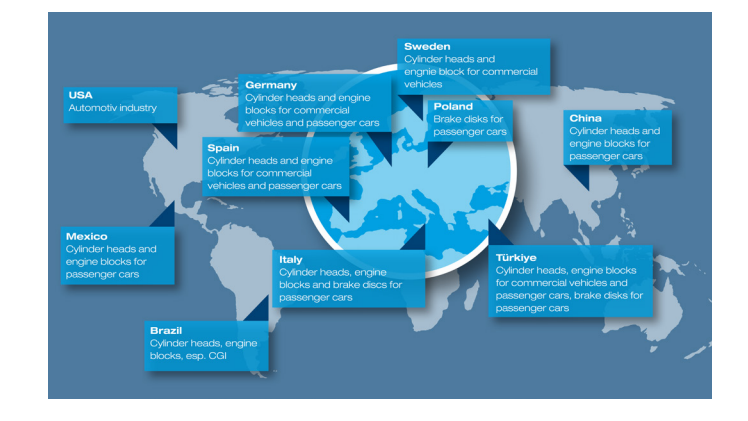
Figure 2: Worldwide use of MIRATEC™ TS

Foundries all over the world are now using MIRATEC<sup>TM</sup> TS coatings to produce complex parts economically. A wide variety of climatic conditions, sands, and binders do not interfere with the peel-off effect of the MIRATEC<sup>TM</sup> TS coating. It works in a wide variety of conditions (Figure 2).