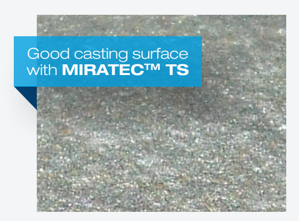
Figure 1: Comparison of the cast surfaces with conventional coating and with MIRATEC™ TS